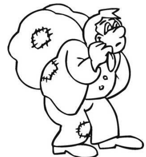
NO JOB, NO