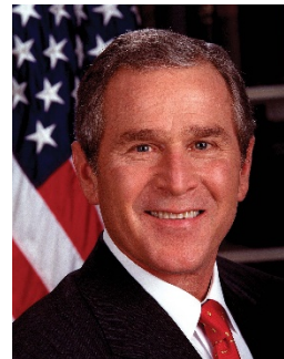
George W. Bush